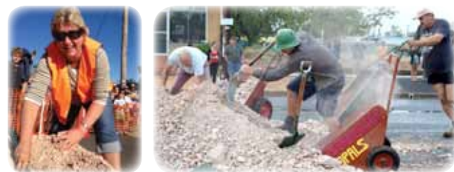
There's HEAPS to see and do around Lightning Ridge. Pack in as much as you can!